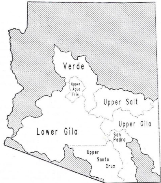
Outside Gila River Basin Tributary Watershed Boundary River System Boundary State Boundary

4 The general adjudication is 5 currently proceeding in the San 6 Pedro River Watershed and the 7 Verde River Watershed. Arizona 8 Department of Water Resources 9 prepared a preliminary hydrographic 10 survey report for the Upper Salt 11 River Watershed in 1992. It neither 12 recommends that a general 13 adjudication of the Upper Salt River 14 Watershed be scheduled for the next 15 watershed nor that the 1992 16 preliminary hydrographic survey 17 report be used for that watershed. Figure 1