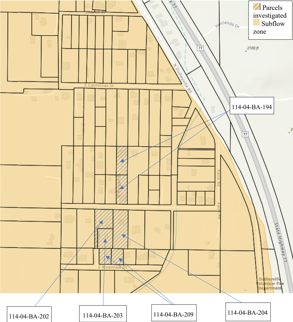
Map Depicting Pinal County Parcel and Subflow Zone

1 2 3 4 5 6 7 8 9 10 11 12 13 14 15 16 17 18 19 20 21 22 23 24 25 26 27 28