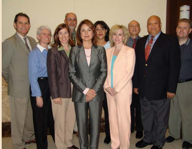
Spanish DUI Court Award Winners