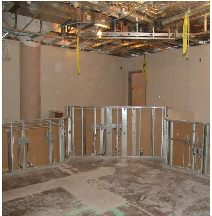
The framework for the first courtroom in the basement of the Central Court Building is completed. The remodel will feature four new courtrooms.