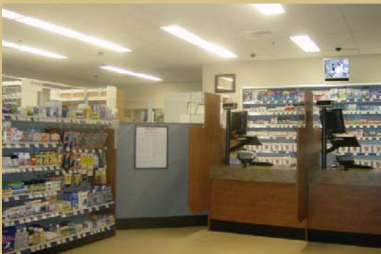
Walgreens recently opened a new clinic/pharmacy on the 2nd floor of the County Administration Building in downtown Phoenix.

Maricopa County is offering this new service location as a convenience for county employees.