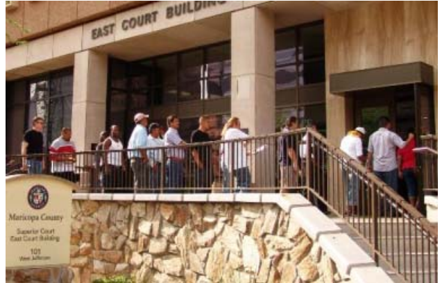
The Capital Improvement Plan should provide improved accessibility to court services throughout Maricopa County.

The tower has many challenges, including determining how to best address issues related to building a tower connecting to existing buildings and how the new facility will enhance downtown's changing environment. It is critical to get input about the individual needs of public and private lawyers, judges, court staff members, criminal justice agencies and the various court customers.