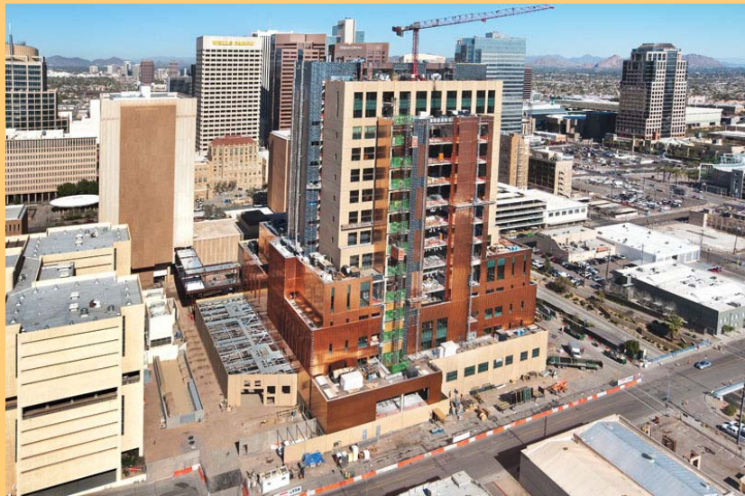
Photo by Maricopa County Court Tower Construction Update