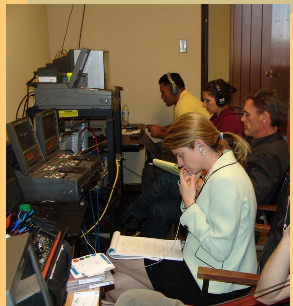
National and local media watch the Faleh Hassan Almaleki trial in the media room in Central Court Building 402. CBS 48 Hours and Fox National News have been present throughout the trial.