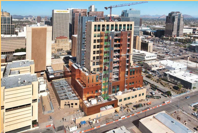
Photo by Maricopa County Court Tower Construction Update