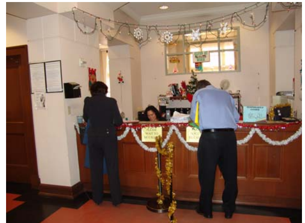
Clerk of the Court filing counter in OCH is decorated for the Holidays.