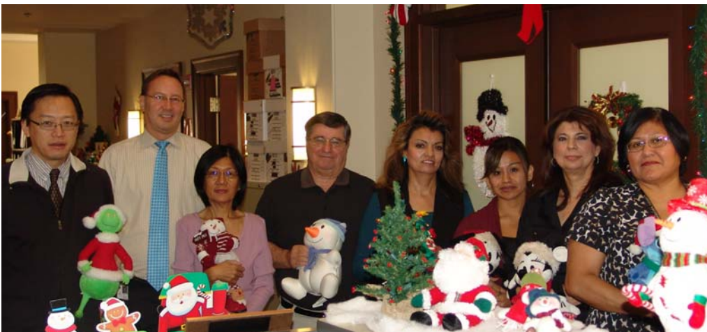
Left - The halls of the fourth floor of the Old Courthouse are decked out this Holiday season.