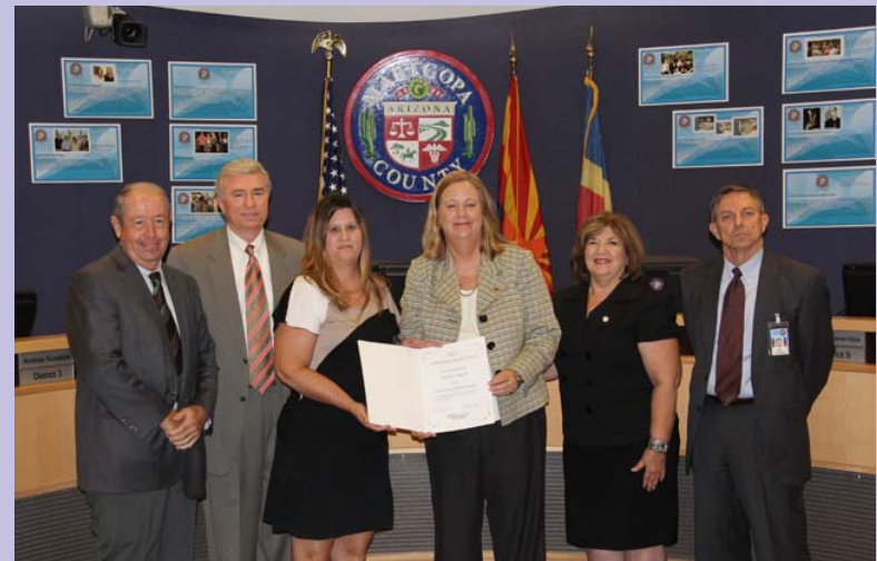
CASA Website and Peer Coordinator Program