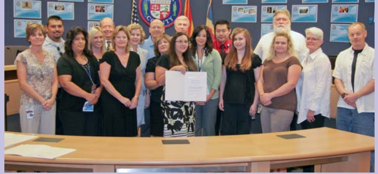
The Legacy Project: A Collaborative Approach to Reducing Recidivism

Superior Court was well represented at the 2012 NACo Achievement Awards Ceremony held at the Board of Supervisors Auditorium in Phoenix. This year's winners included programs from Adult Probation, CASA and Juvenile Court.