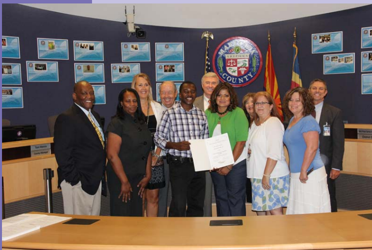
In-House Restoration Education Program