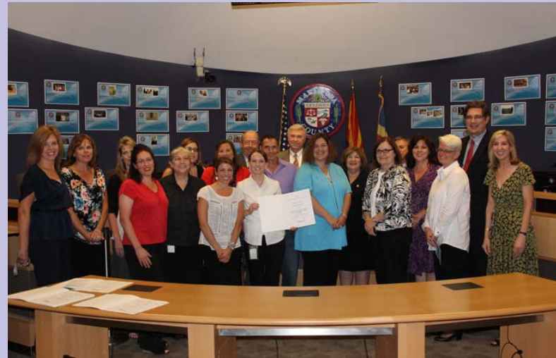
Project SAFE: Improving Outcomes of Transferred Juveniles on Adult Probation