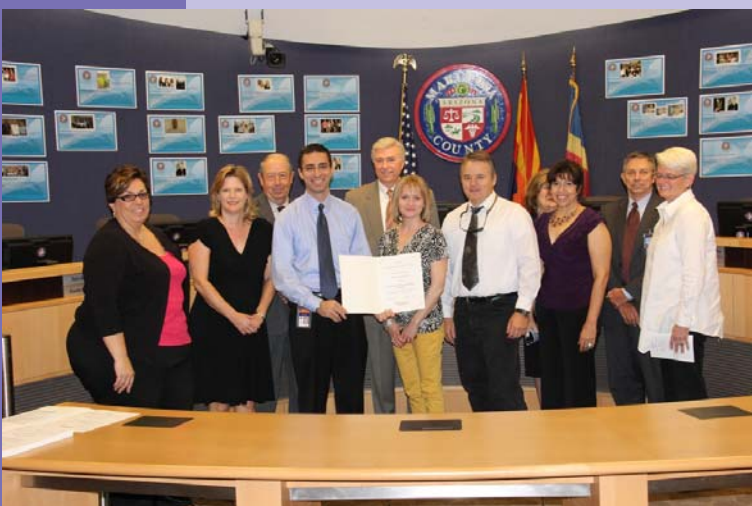
Field Probation Officer Performance Evaluation