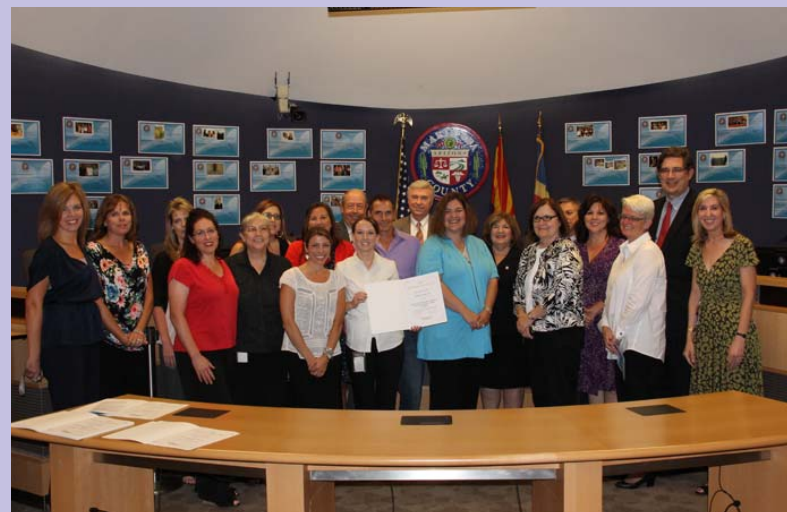
Project SAFE: Improving Outcomes of Transferred Juveniles on Adult Probation