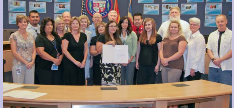
The Legacy Project: A Collaborative Approach to Reducing Recidivism

Superior Court was well represented at the 2012 NACo Achievement Awards Ceremony held at the Board of Supervisors Auditorium in Phoenix. This year's winners included programs from Adult Probation, CASA and Juvenile Court.