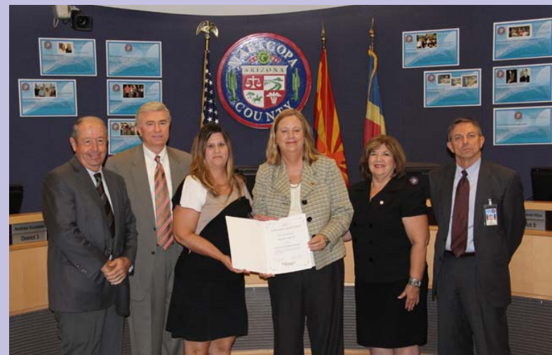
CASA Website and Peer Coordinator Program